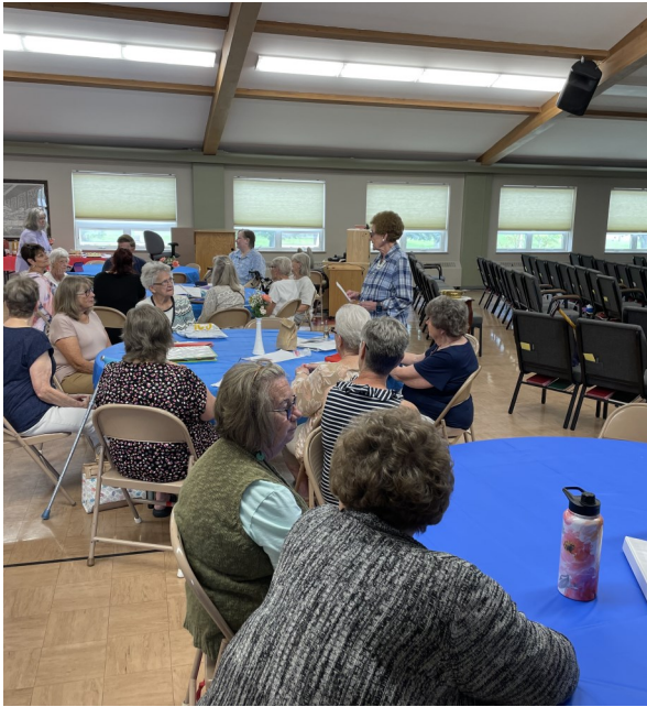
United Women in Faith gathered for a picnic luncheon.

After a summer off, the Methodist women gathered for a picnic lunch in August. Circles meet individually and there is an all Unit Brunch at the beginning of every month.