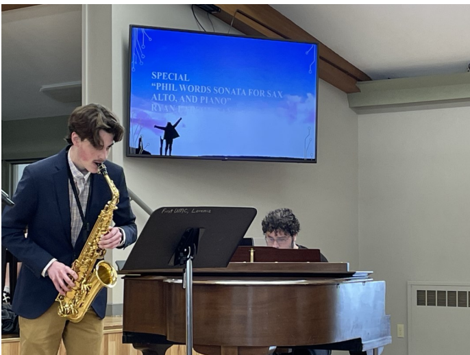
We had many musicians come in this summer to share their talents with the congregation

Join us for home cooked dinners ever Wednesday night at 6PM