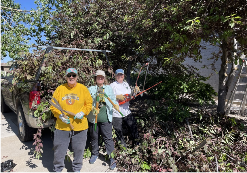
Some congregation members helped take care of the trees this summer