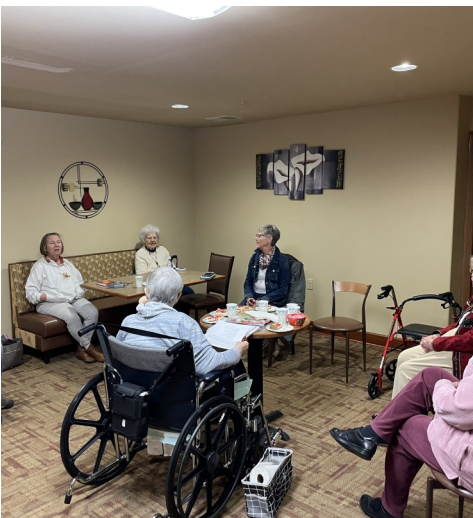
Monday Circle Meeting with some of the UWF ladies